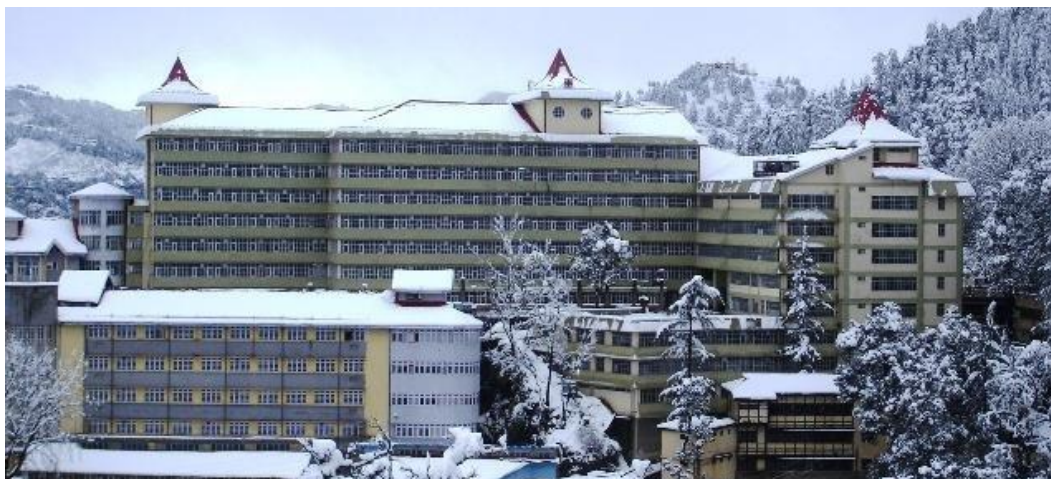
A VIEW OF I.G.M.C. SHIMLA