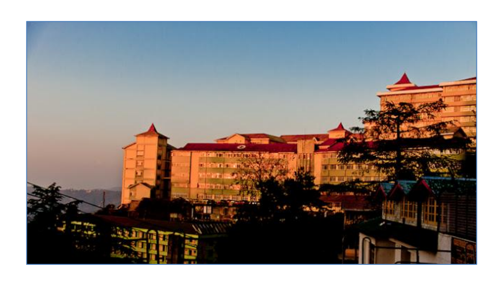
A VIEW OF I.G.M.C. SHIMLA