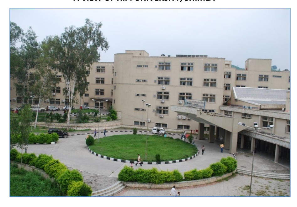
A VIEW OF Dr. R.P.G.M.C, TANDA AT KANGRA (H.P.)